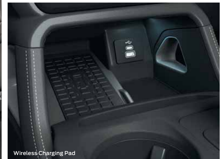
Wireless Charging Pad

Avoid the hassle of having to plug in your phone. Simply place it on the Ranger's wireless charging pad and you're good to go.