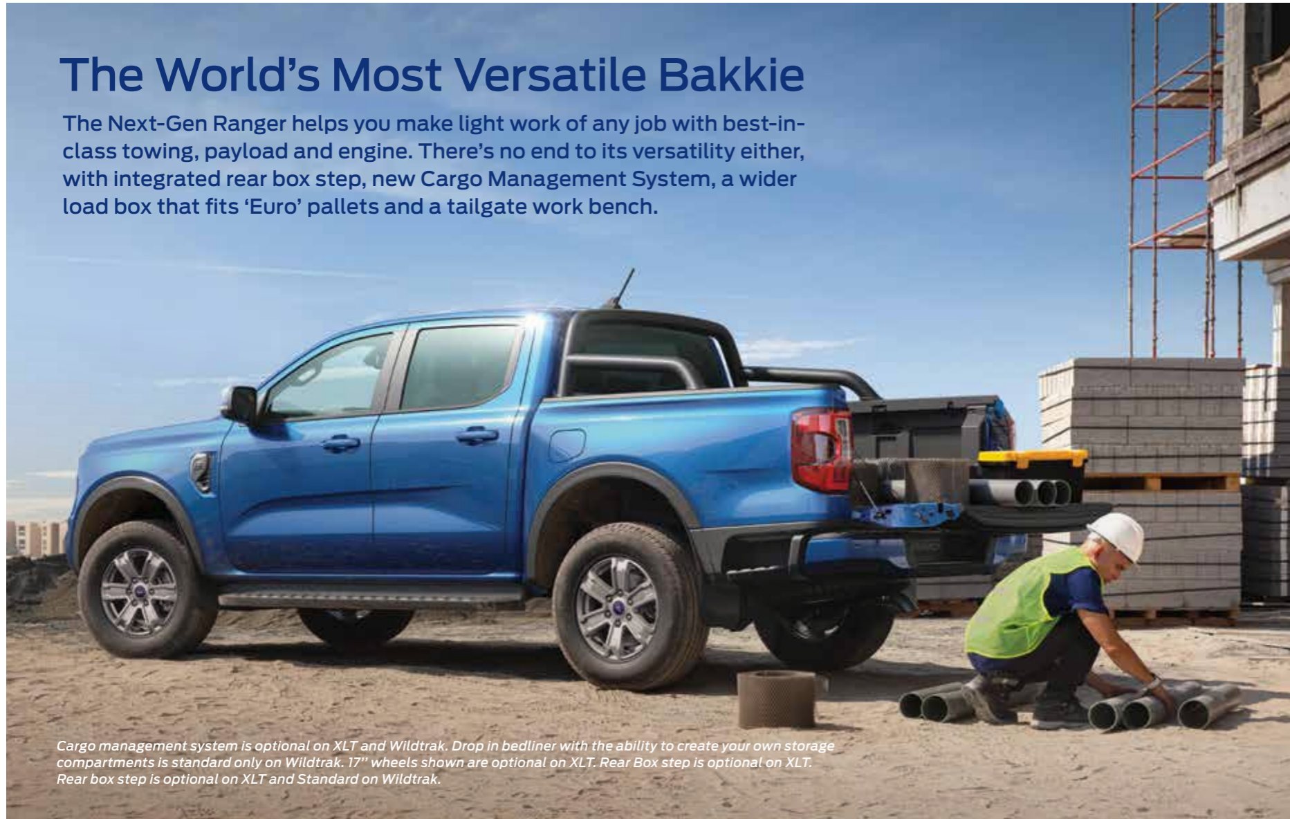
Cargo management system is optional on XLT and Wildtrak. Drop in bedliner with the ability to create your own storage compartments is standard only on Wildtrak. 17" wheels shown are optional on XLT. Rear Box step is optional on XLT. Rear box step is optional on XLT and Standard on Wildtrak.

The Next-Gen Ranger helps you make light work of any job with best-in-class towing, payload and engine. There's no end to its versatility either, with integrated rear box step, new Cargo Management System, a wider load box that fits 'Euro' pallets and a tailgate work bench.