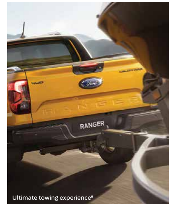
Ultimate towing experience 5