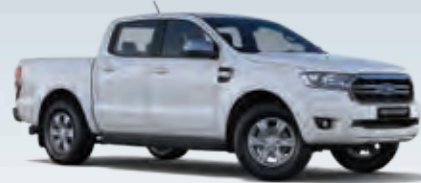
Frozen White (Solid)