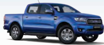
Blue Lightning (Solid)