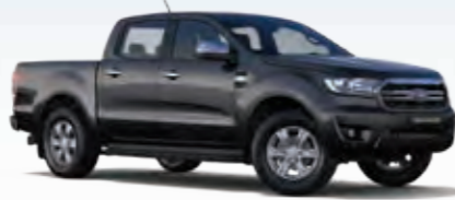
Sea Grey (Metallic*)