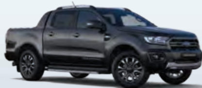
Sea Grey (Metallic*)