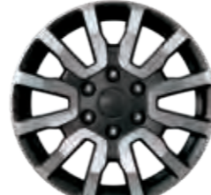
18" Alloy wheel available on Wildtrak only.