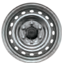
16" Steel wheel