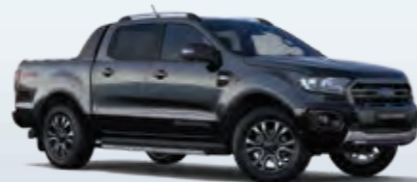
Absolute Black (Metallic*)