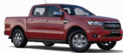
Colorado Red (Solid)