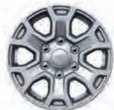
16" Alloy wheel also available as an option on XL derivatives, at an additional cost.