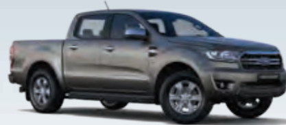
Diffused Silver (Metallic*)