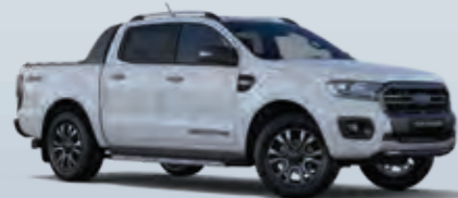
Frozen White (Solid)