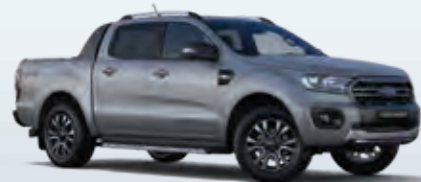
Moondust Silver (Metallic*)