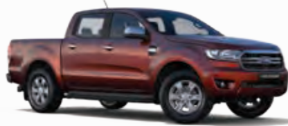
Copper Red (Metallic*)