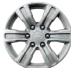
17" Alloy wheel available in Silver, and Black as an option on XLS, and XLT derivatives, at an additional cost. Also available in Black only as an option on XL.