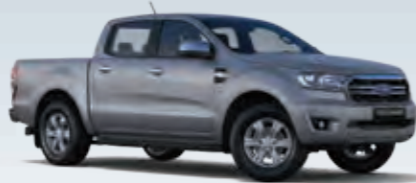
Moondust Silver (Metallic*)