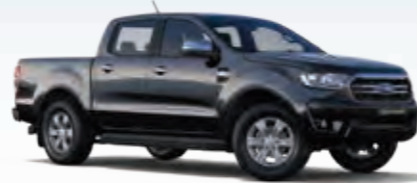
Absolute Black (Metallic*)